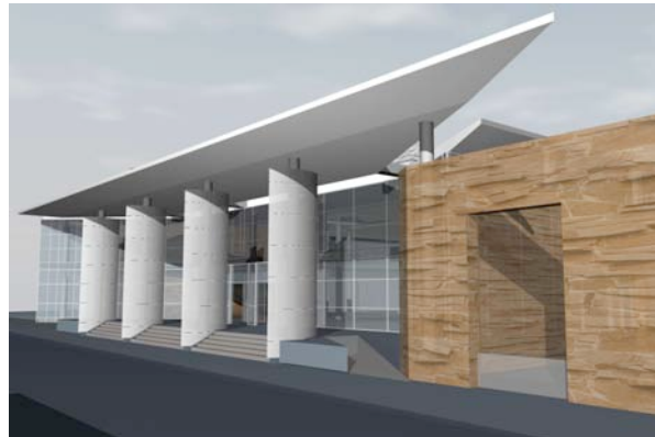
The Planned Library

The AFKPL is in the midst of a $2.1 million fundraising campaign to build, equip and staff the Kigali Public Library. To date, the Kigali Public Library campaign has received pledges of over $2 million. The library will open in the near future, but an additional $500,000 will be necessary to ensure its long-term sustainability.